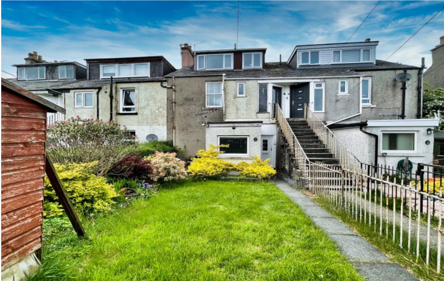
15 Alexander Terrace, Neilston